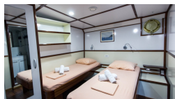
Lower deck cabins