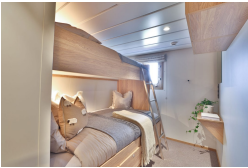
Signature Single - Cabins 6-7 Signature Twin - Cabins 1-2 & 4-5