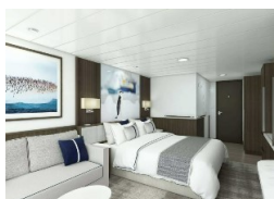
Balcony Stateroom Category B