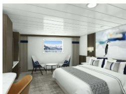
Balcony Stateroom Category A