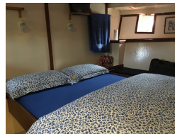
Single Cabin En-suite