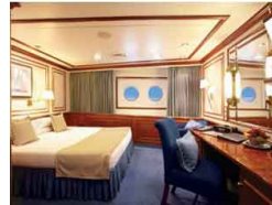
Category 1. From