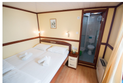
Main Deck Cabins