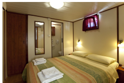
Lower deck cabins