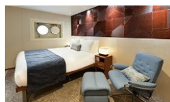
Explorer Deck Balcony Stateroom