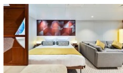
Coral Deck Stateroom