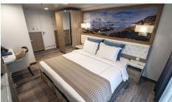
Balcony Stateroom - C Balcony Stateroom Superior Junior Suite