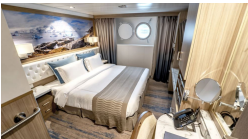
Balcony Stateroom - A Balcony Stateroom - B