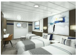
Aurora Stateroom Twin