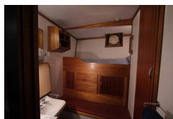
Single Cabin En-suite