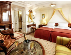
Category C. From