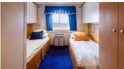
Cabin Category 4