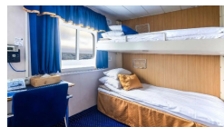
Cabin Category 3