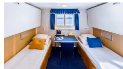
Cabin Category 5