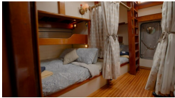
Cabin - Category 2, Option 1