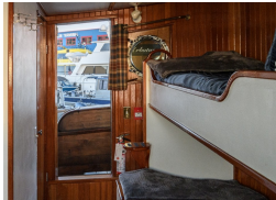
Cabin - Category 3