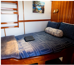
Cabin - Category 2, Option 2