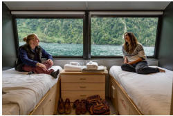
Governor Suite Executive King