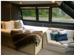
Resolution Deluxe Quadruple