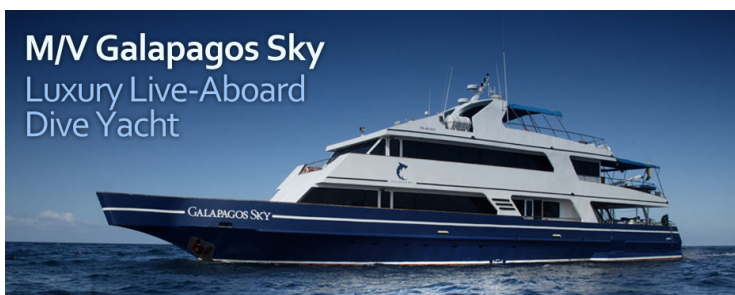
M/V Galapagos Sky Luxury Live-Aboard Dive Yacht