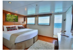
Category 04. From