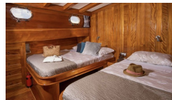
Grand Master Cabin