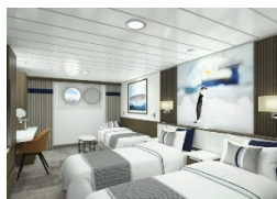
Aurora Stateroom Triple Share