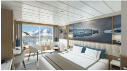
Balcony Stateroom Category C