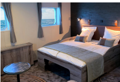
Triple Porthole Twin Porthole