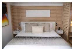
Deluxe Suite Deck 5