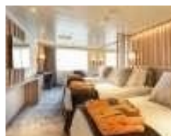
Owner's Suite Solo Panorama