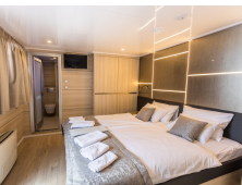
Main Deck Cabin - Sole Occupancy