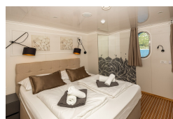
Upper deck cabin