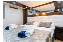
Main deck cabin