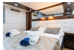
Main deck cabin