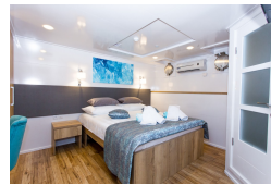
Below Deck Cabin