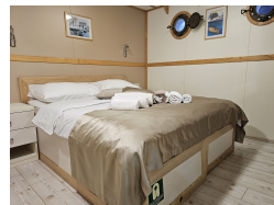
Main deck cabin