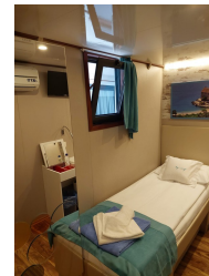
Main Deck Single Cabin Upper Deck