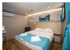
Lower Deck Single Cabin