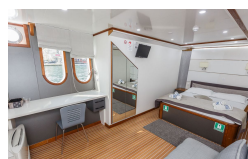
Main Deck Cabin - Twin Cabins