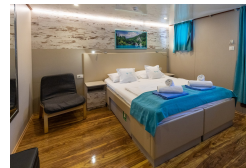
Main Deck Single