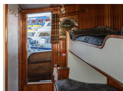
Cabin - Category 3