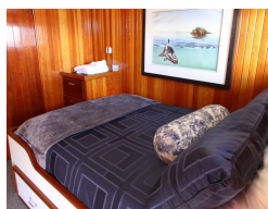
Cabins - Category 1