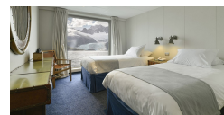
Cabin AAA Superior