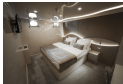
Lower Deck Cabin - waitlist