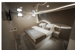
Main deck single