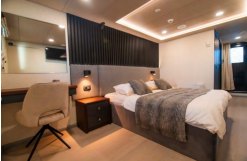
Main Deck Cabin (one available)