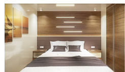
Upper Deck Cabin