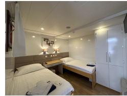
Below Deck Cabin