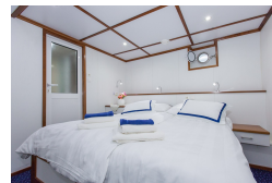
Standard Deck Cabin