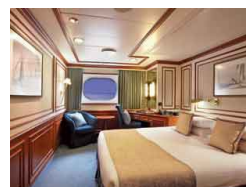
Category 1. From