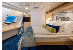
Arctic Superior. From