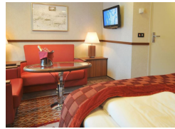
Polar Inside Unspecified