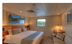
Promenade B Stateroom