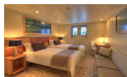
Main Deck B Stateroom