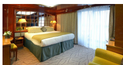
Magellan Deck Standard Single