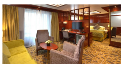
Explorer Deck Owner's Balcony Suite