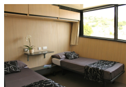
Below Deck Cabin