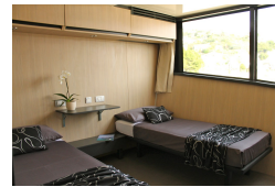
Below Deck Cabin