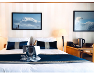
on Cabin deck 3

small-cruise-ships.com info@small-cruise-ships.com