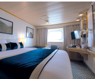
on Cabin deck 5