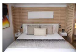
Deluxe Suite Deck 6