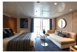
Deluxe Suite Deck 5