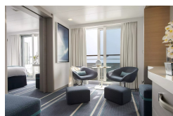
Prestige Deck 4