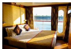
Luxury Cabin with Balcony