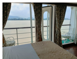
Superior Cabin without Balcony