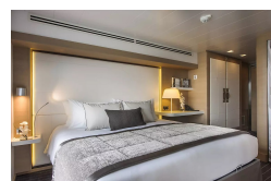
Prestige Deck 5 Suite