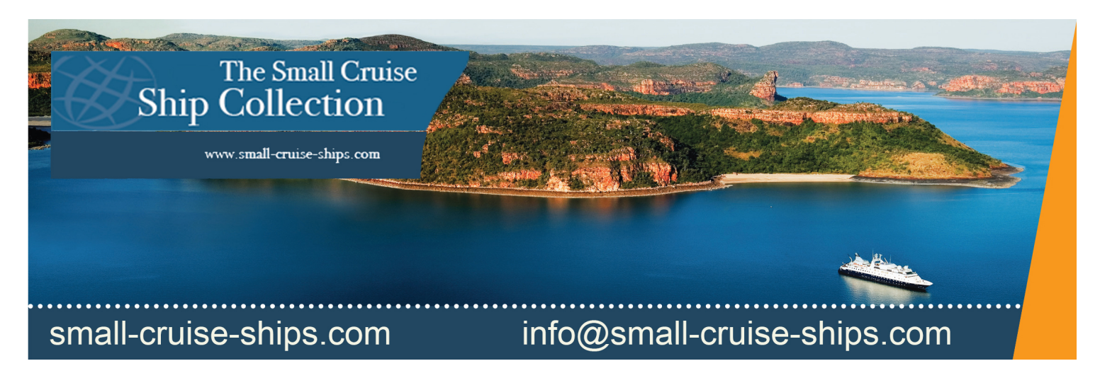
Day 8 Cruising Doubtful Sound & Cruising Milford Sound

As with all of New Zealand's fiords, Doubtful Sound is a masterpiece of nature. The only way to reach it is by boat, crossing Lake Manapouri, so of the three Sounds (Dusky and Milford being the other two), Doubtful is the least touristy. Thus those who are lucky enough to experience Doubtful Sound deserve it. Because of the Sound's inaccessibility, you'll encounter very few people as you float through the silent waterways. Animals, however, are a different matter. Because of the lack of human interaction. Mother Nature has been given free rein here. The dense forest is rife with wildlife and birdsong is a constant soundtrack (otherwise it is the sound of silence). In the water, you can expect to get up close and personal with fur seals, pods of bottlenose dolphins and some lucky souls have even sighted the occasional whale and albatross. Ornithologists will no doubt already know that Doubtful Sound is home to the rare Fiordland Crested Penguin, so be sure to keep your binoculars ready as it would be a shame to miss the once-in-a-lifetime sighting. The region is famous for its seven-meter annual rainfall, so do not be surprised if the sun isn't shining. Yet despite the potential mist, Doubtful Sound remains majestic. The waterfalls are more mesmerizing, the glassy water more mysterious, and the mountains rising into the clouds more impressive. As the Fiordland's website puts it, Doubtful Sound offers its visitors "cloistered serenity". Expect to be both humbled and uplifted.