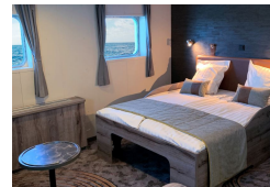
Triple Porthole - Waitlist