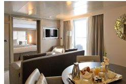
Prestige Stateroom Deck 4