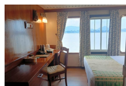
Suites with balcony