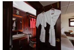
Premier suite on the upper deck