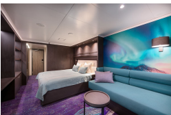
Triple Porthole Twin Deluxe Twin Porthole Twin Window