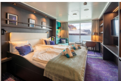
Quadruple Porthole Superior