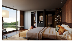
Second Deck Cabin From